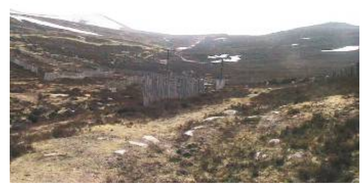
Fig. 3: general terrain over which path / trail is proposed