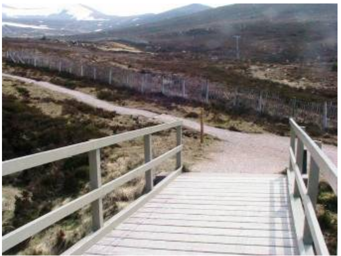
Fig. 2: existing sections of lower Coire Cas trail

Full planning permission is being sought in this application for the 1. construction of an extension to the Coire Cas trail footpath at Cairngorm ski area. The path / trail is proposed to extend approximately 400 metres and would connect the existing lower Coire Cas trail with the upper Coire Cas mountain trail, close to the former middle ski station. The new section of path would start approximately 500 metres uphill to the south east of the Day Lodge. The proposed development is in an area which the applicants indicate experiences only limited ski activity. present in the absence of a path in this area many walkers tend to use the ski tow lines (out of the operating season) to walk up and down. In support of the proposal, the applicants have put forward the view that the development would allow "appreciation and interpretation of the natural regeneration of mountain scrub on the site."